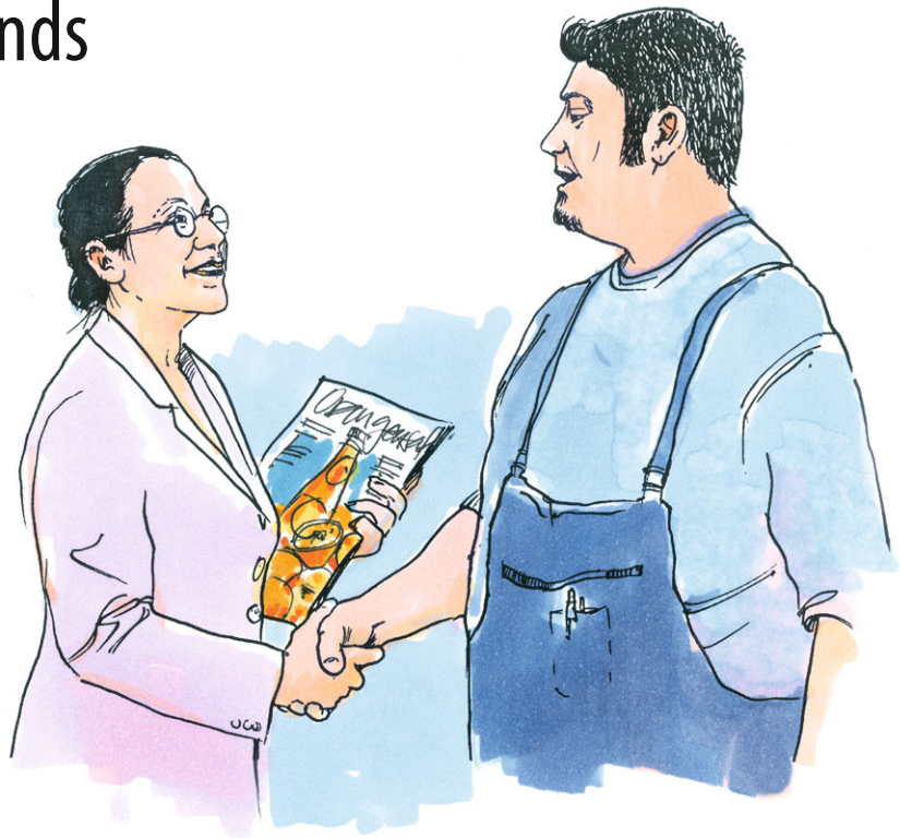
Process Standard Offset – a firm foundation for working together.

A much more likely scenario is that problems with colour reproduction will be consigned to the past, because with Process Standard Offset everyone is singing from the same hymn sheet.